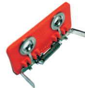
Shunts - 0.001Ω, 0.01Ω, 0.1Ω