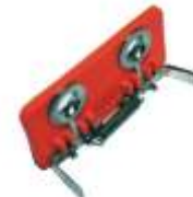
Shunts - 0.001?, 0.01?, 0.1?