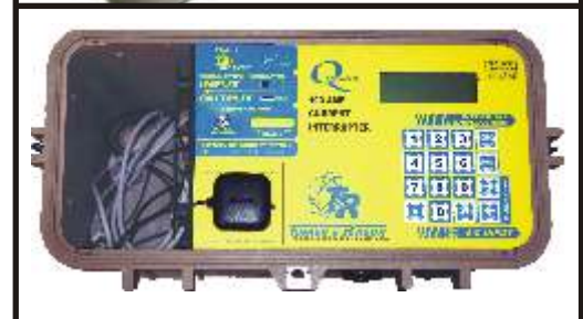
Cable Storage inside Case