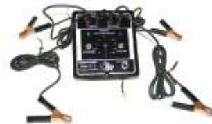
Complete kit with cables